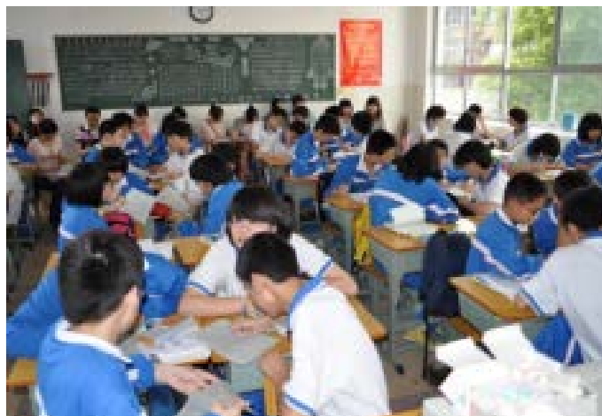
Figure 3 College English