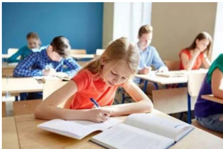
Figure 2 College English